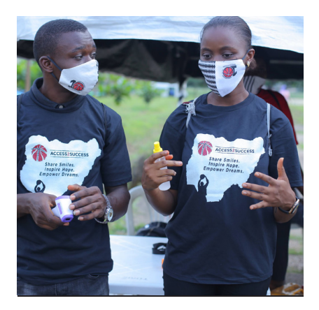
A2S Nigeria Scholars - The A2S Nigeria Scholars assist our Nigerian team with maintaining medical protocol during the pandemic and serve as volunteers at various events.